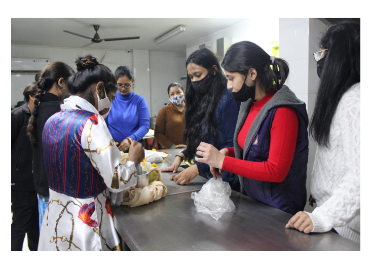
Beneficiary Training Session at STOP India, Chhatarpur